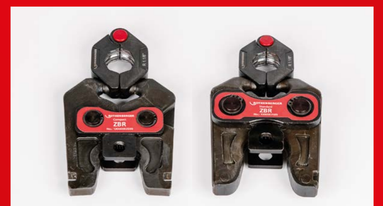
Press rings compatible with Standard and Compact Actuator jaws