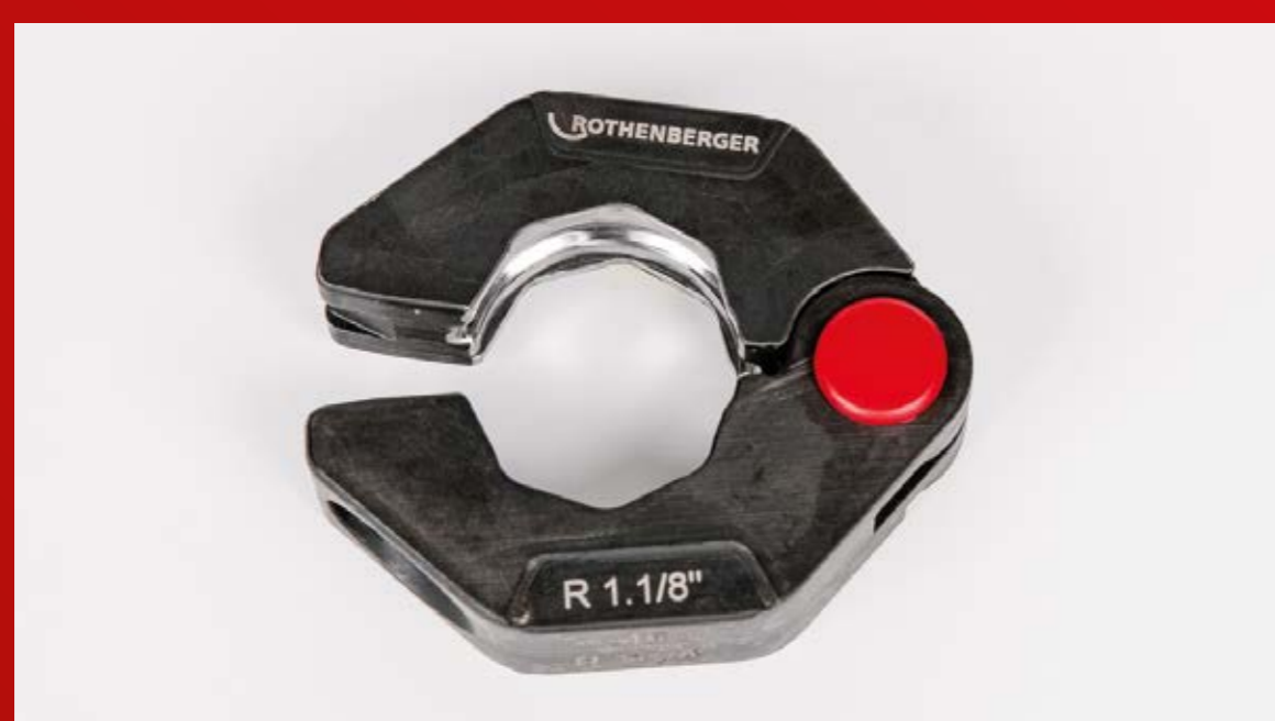
The locking position allows to place the press ring on the fitting with one hand