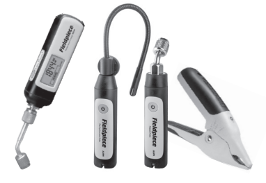
Vacuum Gauges & Job Link® System Probes