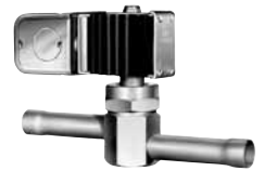
Type E10S250 Normally Closed