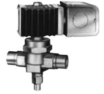
Type MB10S2 Normally Closed

*Add 1.12" for Valves with Manual Lift Stem.