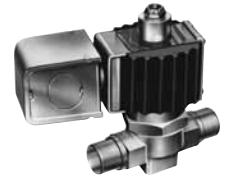
Type OB10S2 Normally Open